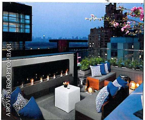
ABOVE'S ROOFTOP BAR

Is this New York's COOLEST uptown hotel? We think so. It's the downtown FEEL that seals it